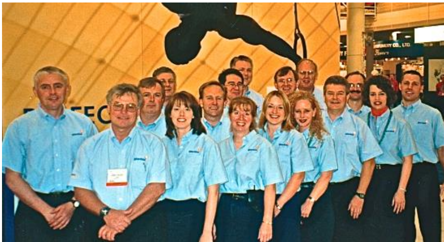
With Glanbia Ingredients Team at IFT