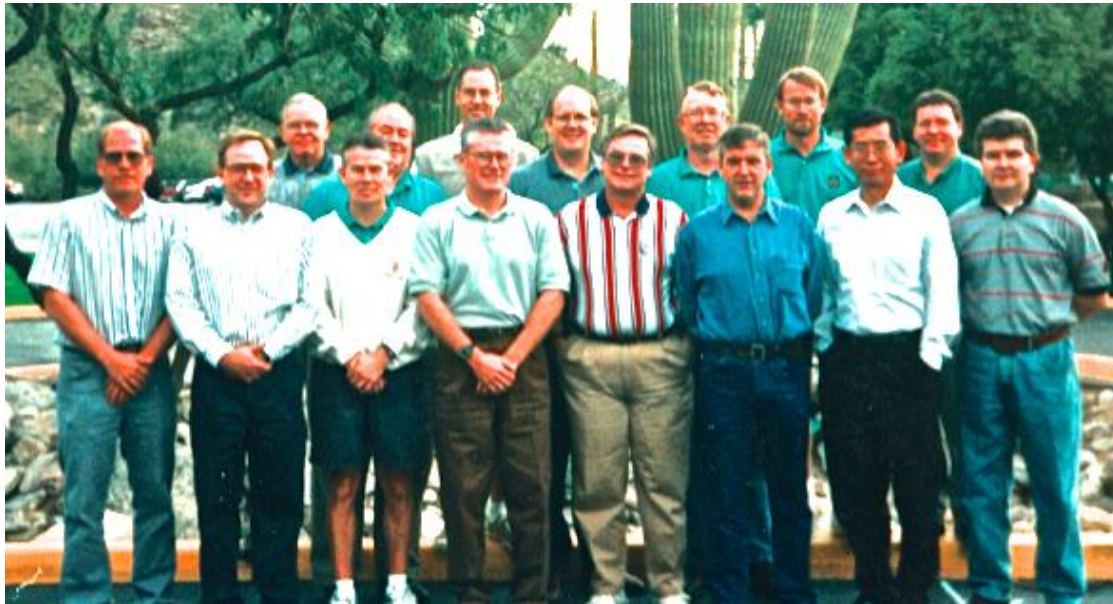
Management Retreat in Tucson, AZ in 1995